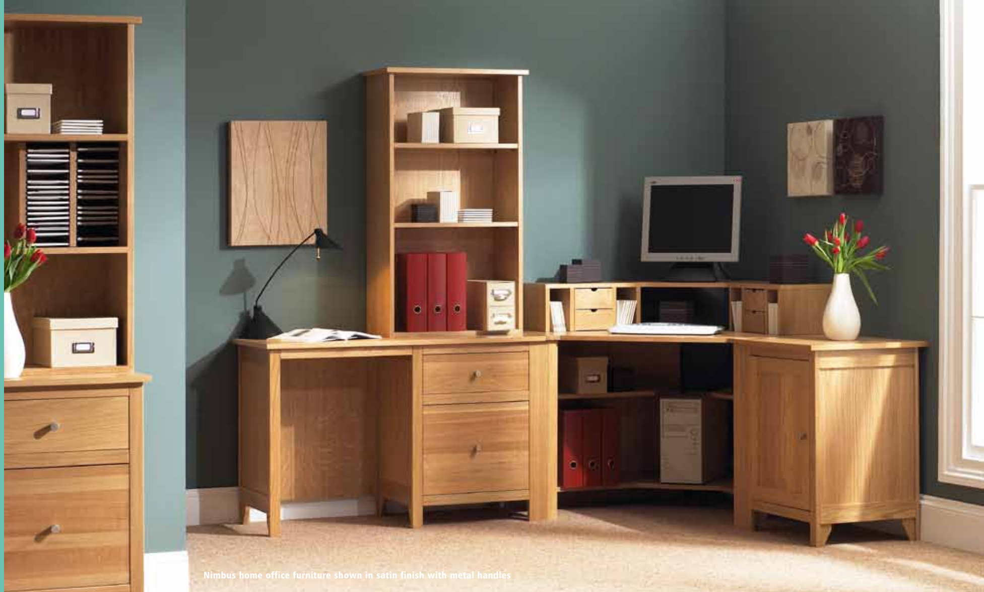
Nimbus home office furniture shown in satin finish with metal handles

Contemporary Classic Oak Home Office Furniture by Corndell